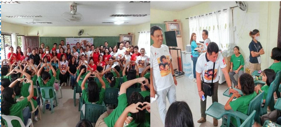
Picture Gallery: RC West Davao 53<sup>rd</sup> Induction Ceremony and Gov. Visit 2024., July 7, 2024